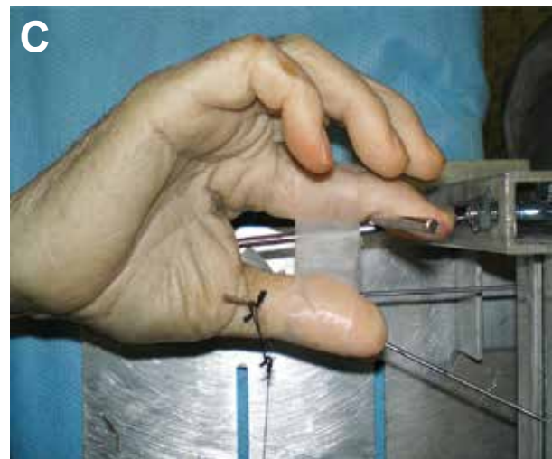
Figure 3. Valgus stress at 30° thumb flexion applied with proper and accessory UCL incised (A), buddy taping of thumb to index (B), a with the index immobilized (C).