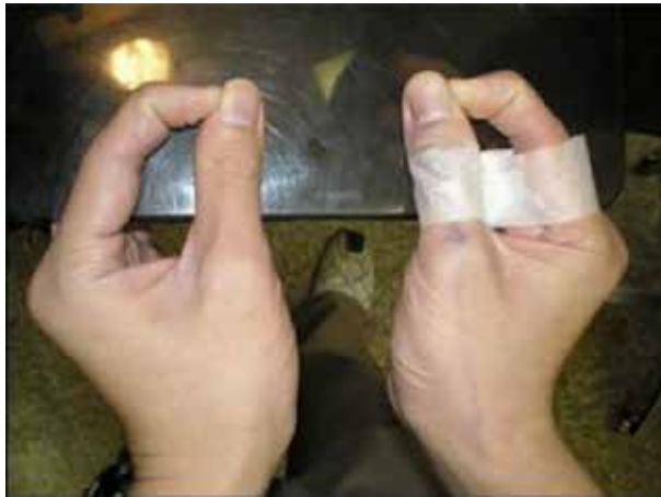
Figure 1. The application of buddy taping the thumb to the index as a functional brace for UCL injuries.

Although thumb spica splints are commonly used for treatment of UCL injuries of the thumb, good results after functional bracing of ligamentous injuries of the MCP joint of the thumb have been reported (2,3). Functional bracing is particularly useful as definitive treatment for incomplete ruptures or interim treatment while awaiting surgery. However, functional bracing is limited by the lack of widespread availability. The purpose of the study was to assess the effectiveness of buddy taping as a functional brace for treatment of UCL injuries of the thumb by using a cadaveric model (Figure 1).